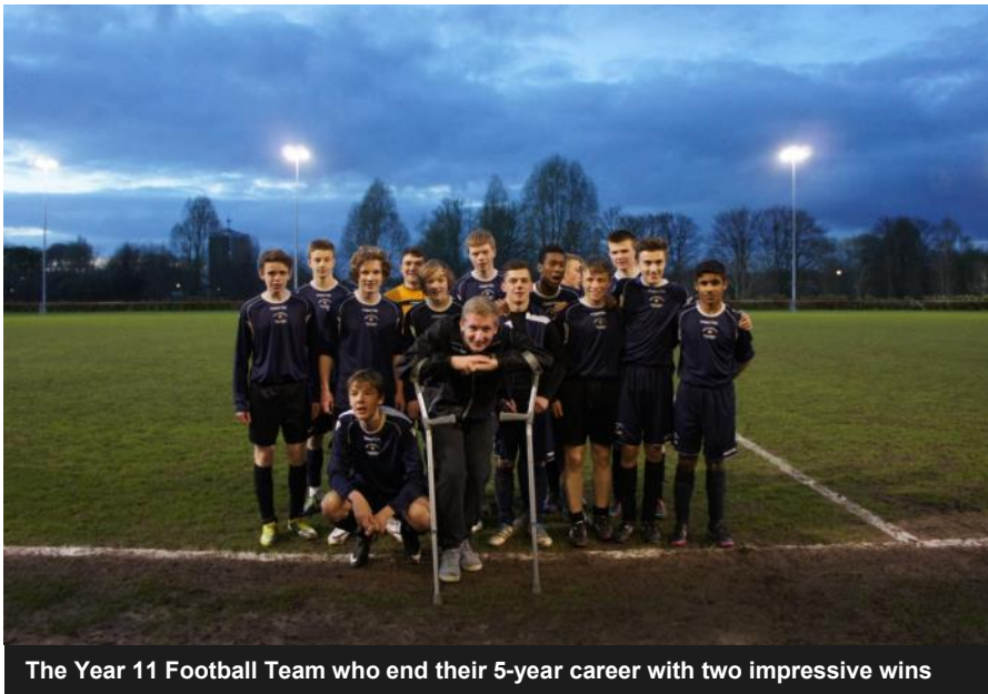
The Year 11 Football Team who end their 5-year career with two impressive wins