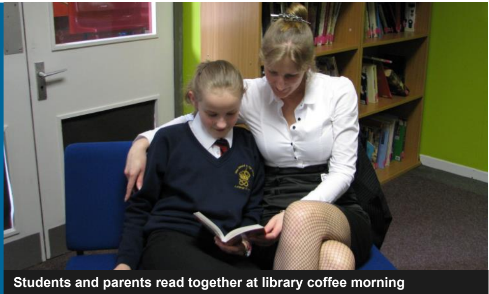
Students and parents read together at library coffee morning