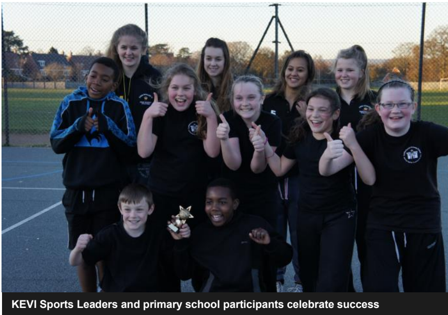
KEVI Sports Leaders and primary school participants celebrate success